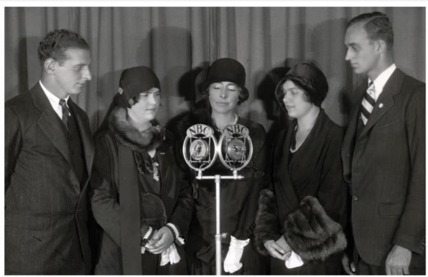
League on the Radio: 1928 Presidential Campaign