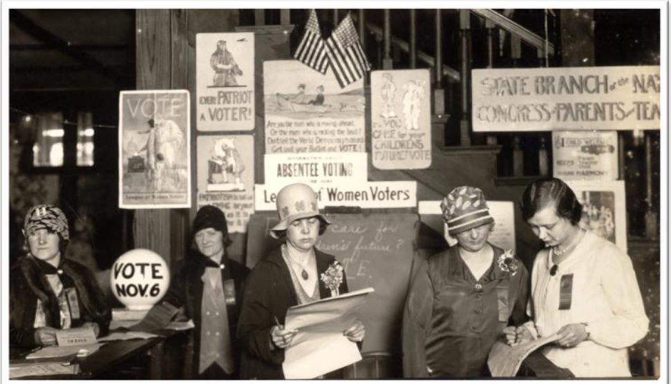
Get Out the Vote — 1928