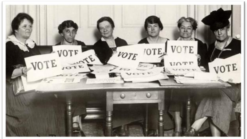
League Members and Vote Signs