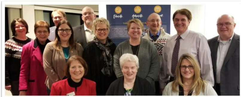
Pictured: Some of the officials who attended the 2020 event

Minnesota's future will be determined by its recovery. COVID-19 has highlighted the challenges and inequities in our economic, criminal justice, healthcare, and educational institutions, among others. We have a unique opportunity to hear directly from our legislators and county commissioners during the annual Conversations with Constituents event on Thursday, January 21!