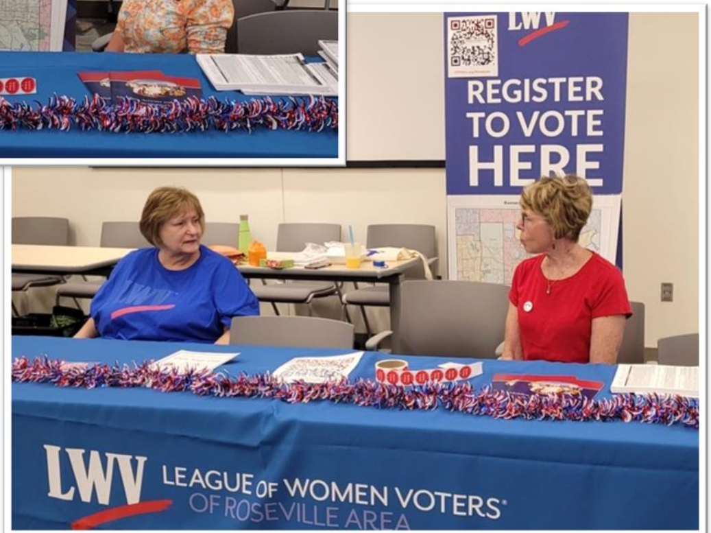
League members volunteering for Voter Services at Roseville Area Community Volunteer Fair on August 10 at Annpétu Tēcá Education Center